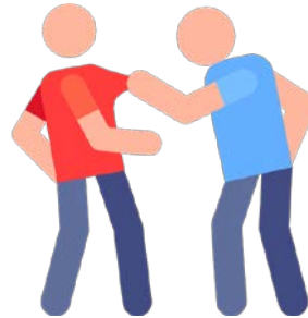
Client drunk, on drugs, being disruptive