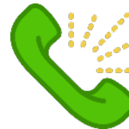
Threatening phone calls