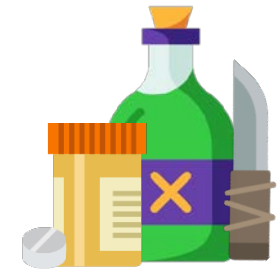
Drugs, alcohol, or weapons