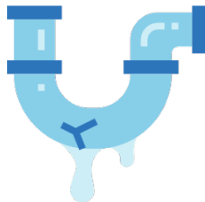
Problems with shelter