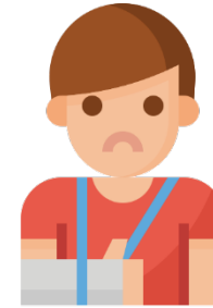
Clearly battered child